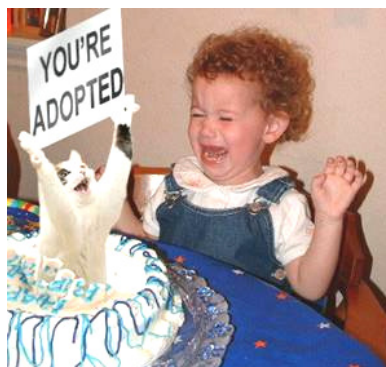
E Grade – Like B-Grade, is still very capable of a few surprises before the Season is out.