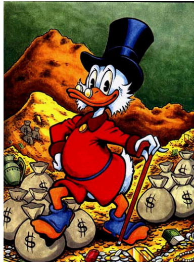
C-Sections - Right on the money like Scrooge McDuck over the last month or so.

The C-No Evils have 3 more games to attempt to work their way into a possible Home final at Tigerland, which could see the first sell-out of the Sporting calendar at the Den!